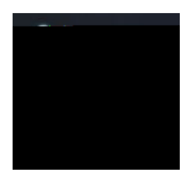
Tubes often used in Micro Centrifuges

Water miscible substances, weak acids / alkalis